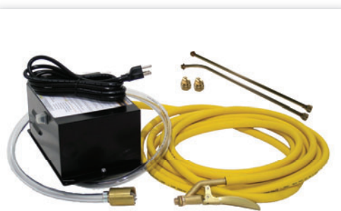
AC Standard Kit shown.

With the power of the original REAL PUMP power spraying system, The REAL PUMP EXPRESS is a compact, easily mountable pump designed to replace gas engine powered and pump up sprayers. This pump is available in 6 different, fully assembled kits, or configure your own pump from 9 different styles. It easily sprays from any container including 1, 5, 55 or 275 gallon sizes. Need to mount the pump? The unit has standard-size bolt holes and multiple suction hose ports for easy mounting to anything from walls, dollies, trucks, equipment and more.