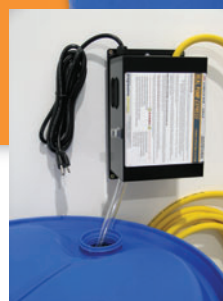
*DRUM NOT INCLUDED.