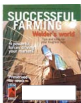
As featured in March 2008 Successful Farming Magazine